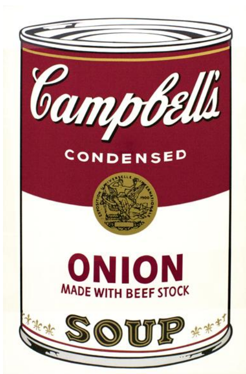
Artist: Warhol, Andy Object: Campbell's Soup I (Onion) Date: 1968 Medium: Screenprint/Ink Technique: Print Frame Description: White Wood Frame Frame Size: 37" H x 24 1/2" W Condition: Excellent One from a series of ten screenprints titled "Campbell's Soup I" Published by Factory Additions, New York; printed by Salvatore Silkscreen Co., Inc., New York Set number 31, Campbell's Soup 1