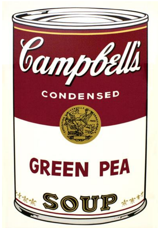
Artist: Warhol, Andy Object: Campbell's Soup I (Green Pea) Date: 1968 Medium: Screenprint/Ink Technique: Print Frame Description: White Wood Frame Frame Size: 37" H x 24 1/2" W Condition: Excellent One from a series of ten screenprints titled "Campbell's Soup I" Published by Factory Additions, New York; printed by Salvatore Silkscreen Co., Inc., New York Set number 31, Campbell's Soup 1