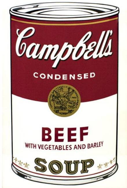
Artist: Warhol, Andy Object: Campbell's Soup I (Beef) Date: 1968 Medium: Screenprint/Ink Technique: Print Frame Description: White Wood Frame Frame Size: 37" H x 24 1/2" W Condition: Excellent One from a series of ten screenprints titled "Campbell's Soup I" Published by Factory Additions, New York; printed by Salvatore Silkscreen Co., Inc., New York Set number 31, Campbell's Soup 1