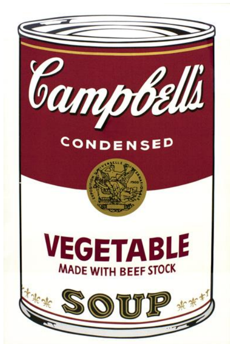
Artist: Warhol, Andy Object: Campbell's Soup I (Vegetable) Date: 1968 Medium: Screenprint/Ink Technique: Print Frame Description: White Wood Frame Frame Size: 37" H x 24 1/2" W Condition: Excellent One from a series of ten screenprints titled "Campbell's Soup I" Published by Factory Additions, New York; printed by Salvatore Silkscreen Co., Inc., New York Set number 31, Campbell's Soup 1