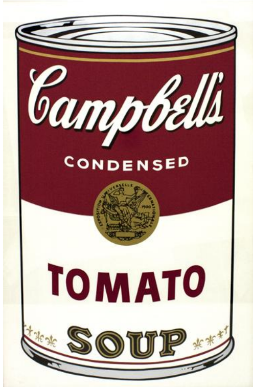
Artist: Warhol, Andy Object: Campbell's Soup I (Tomato) Date: 1968 Medium: Screenprint/Ink Technique: Print Frame Description: White Wood Frame Frame Size: 37" H x 24 1/2" W Condition: Excellent One from a series of ten screenprints titled "Campbell's Soup I" Published by Factory Additions, New York; printed by Salvatore Silkscreen Co., Inc., New York Set number 31, Campbell's Soup 1